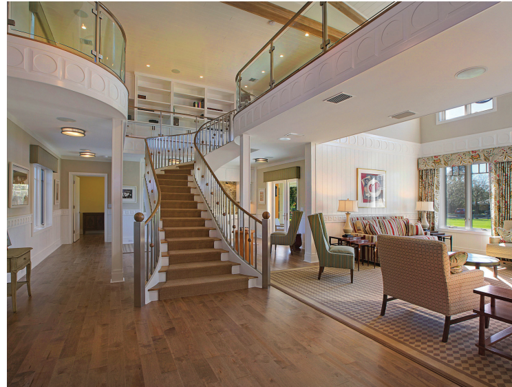
WELLINGTON SOUTH END | $9,900,000

Spectacular 10-acre farm with room for a covered arena | 2 barns totaling 15 stalls | staff quarters | large all-weather arena | abundant turnout plus a gorgeous riding field | completely renovated home by Wellington's top builders and top interior designers | impact glass, gas range, and whole house generator