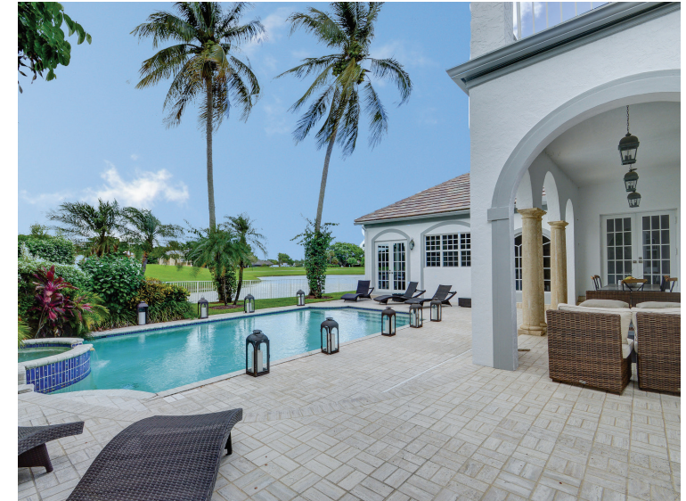
PALM BEACH POLO | BROOKSIDE 2 | $2,200,000

Meticulously renovated estate on 5.4 landscaped acres | 5 bedrooms, 4.5 bathrooms | split bedroom floor plan | impact glass | covered patio with summer kitchen and new pool | 8-stall center-aisle barn | 135' x 230' fiber footing riding arena and 7 turnout paddocks