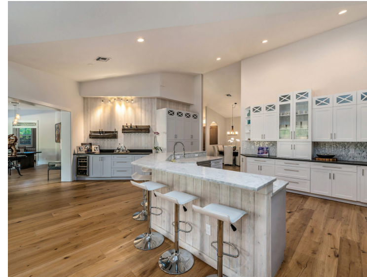
PALM BEACH POINT | $4,900,000 | PRICE REDUCTION

Fabulous 15-acre professional equestrian facility complete with a large covered arena | additional all-weather arena | GGT footing | 42 stalls and 23 spacious turnout paddocks | walker and round pen | 3-bedroom, 2.5-bathroom caretaker's home | 1-bedroom, 1-bathroom guest house | numerous staff quarters | all overlooking a beautiful lake with a sunset view