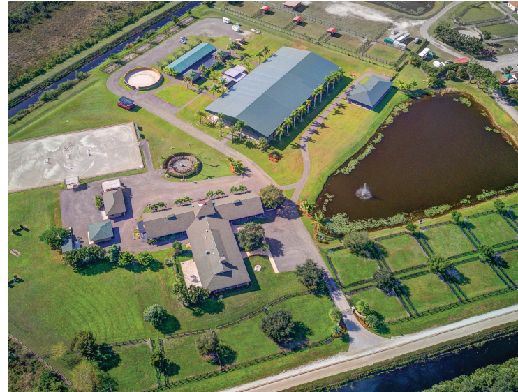
140TH AVE. S | $9,650,000

Spectacular 10-acre farm with room for a covered arena | 2 barns totaling 15 stalls | staff quarters | large all-weather arena | abundant turnout plus a gorgeous riding field | completely renovated home by Wellington's top builders and top interior designers | impact glass, gas range, and whole house generator