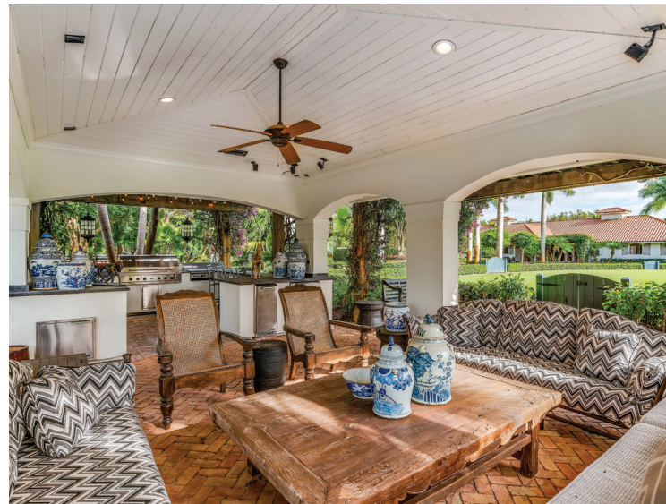
SADDLE TRAIL | $13,900,000

Perfect for the equestrian family | 5-bedroom, 6.2-bathroom estate in Palm Beach Polo & Country Club | masterfully redone | new roof, wood flooring, and upgraded kitchen and baths | impact glass windows and French doors | phantom screens | tropical pool area | prime location with a coastal feel