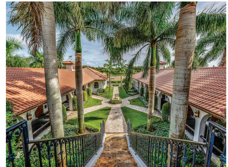
GRAND PRIX FARMS | $7,950,000

Breathtaking 20 acres near Dye Golf Course | 8,405 square foot main house | 1-bedroom, 1-bathroom guest house above 3-car finished garage | architectural design by Cesar A. Molina of CMA Design Studio | interior by Marlene Murrah Interiors | Belgian oak floors throughout | Wolf, Miele, and Sub-Zero appliances with granite farmhouse sink in kitchen | master with dual walk-in closet systems, marble bath and rain shower | private gym and saltwater Pebbletec pool | 6-stall barn with groom's apartment | copper gutters and rain chains