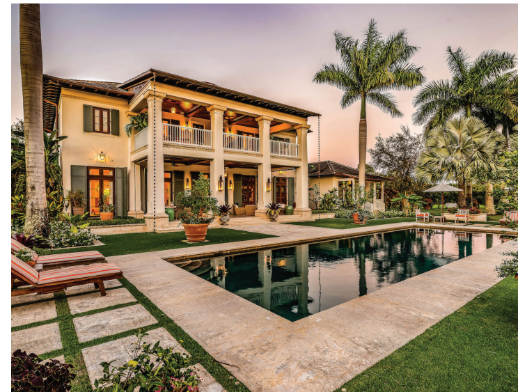
RANCH COLONY | JUPITER | $8,450,000

Pristine farm on almost 5 acres | on the bridle path to PBIEC | 2 barns sold turnkey totaling 12 stalls | automatic fly spray system | 12 irrigated paddocks | GGT arena and grass jump field | 4-bedroom, 4-bathroom home completely renovated in 2015 | gourmet kitchen with double ovens by Wolf | Sub-Zero fridge, 2 Sub-Zero wine fridges, and 2 Asko dishwashers | Sonos sound system and security cameras | reverse osmosis water treatment system