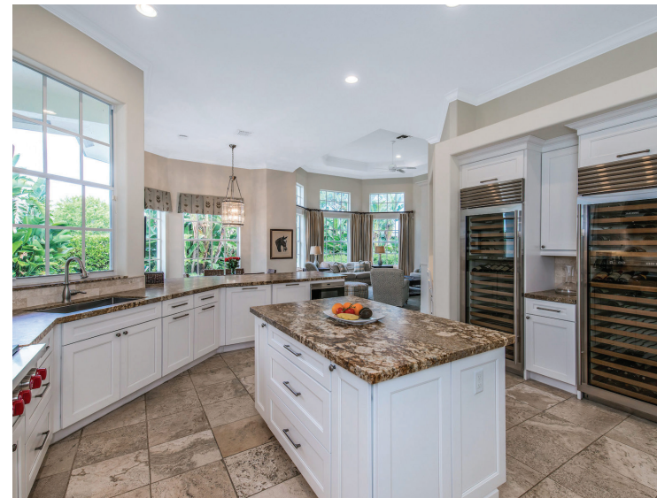
SADDLE TRAIL | $4,299,000 | PRICE REDUCTION

European-inspired estate on 4.11 acres | renovated in 2015 | 4 bedrooms with ensuite bathrooms and walk-in closets | private balconies | master suite with fireplace and marble master bathroom | wide-plank hardwoods and volume ceilings | oversized eat-in island | Wolf 6-burner gas range | French doors | Chicago brick patio with summer kitchen and saltwater pool | Lutron HomeWorks security system | 2 garages | full-service gym | 14-stall barn | 3-bedroom grooms' apartment | Aquaspa and equine treadmill | 4-horse Kraft walker | 7 paddocks | all-weather arena and grass jump field